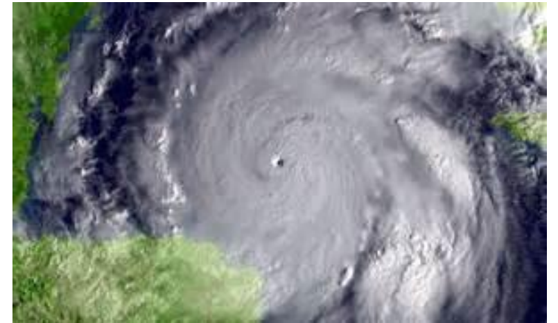
Hurricane Wilma October 2005